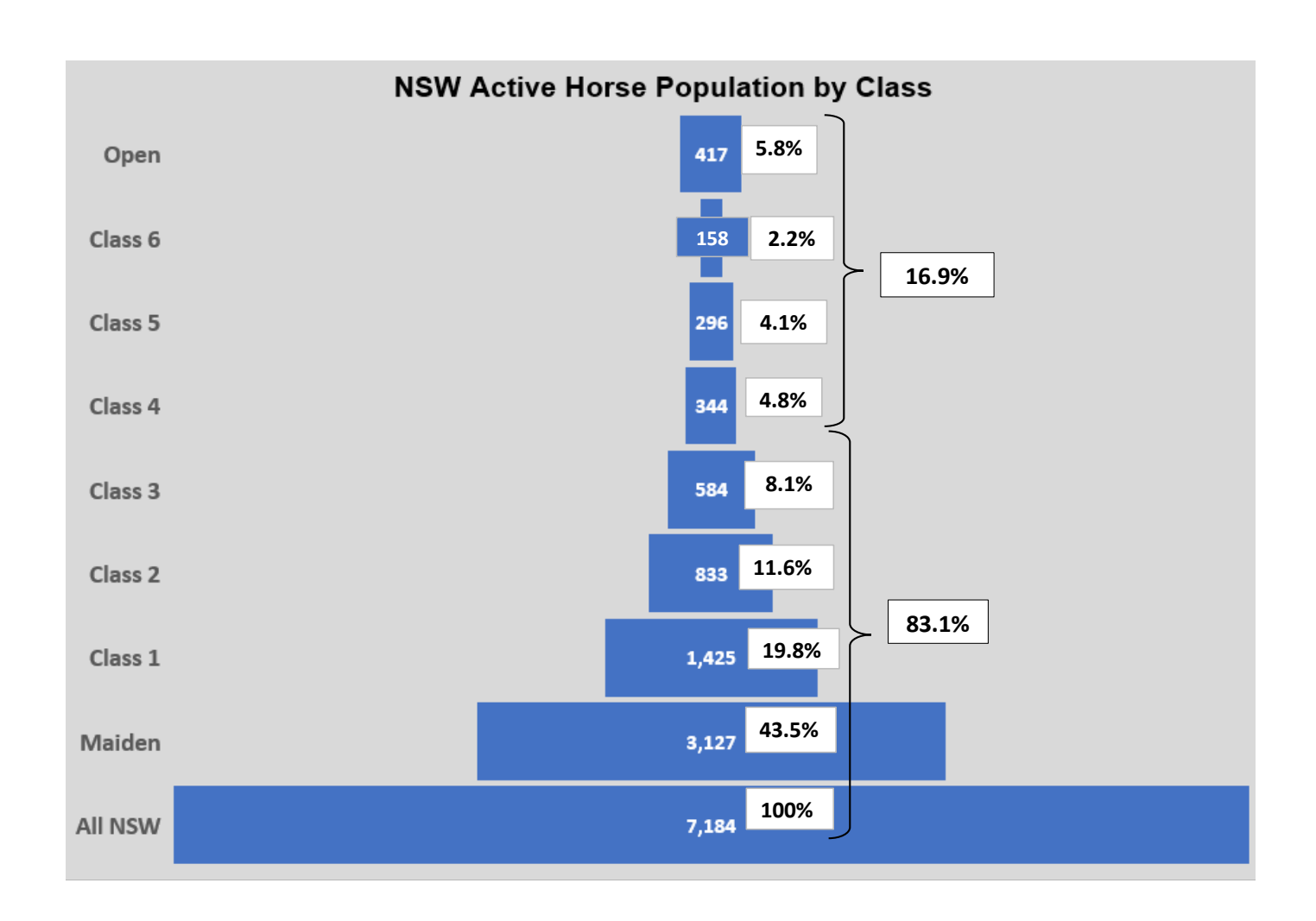
Chart 1-NSW Active Horse Population by Class

Of the NSW horse population, 83% have won less than three races.