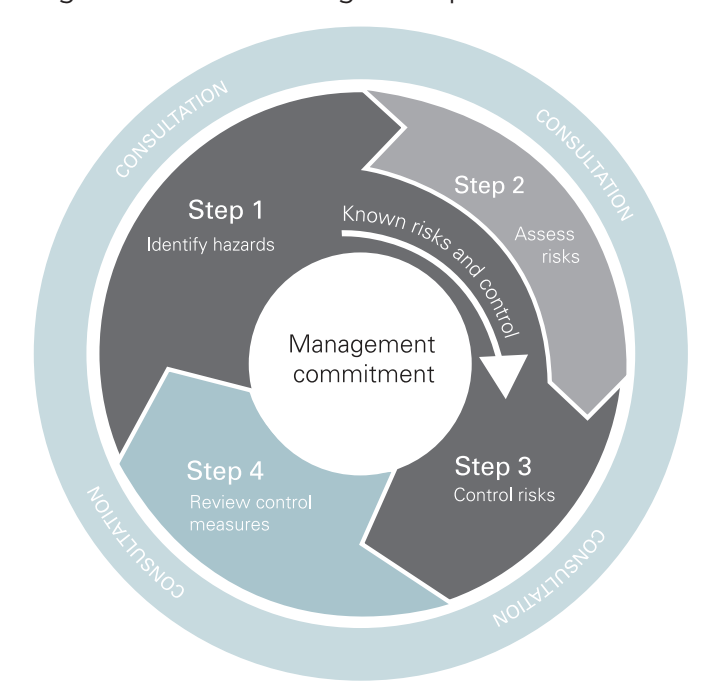
Figure 1: The risk management process